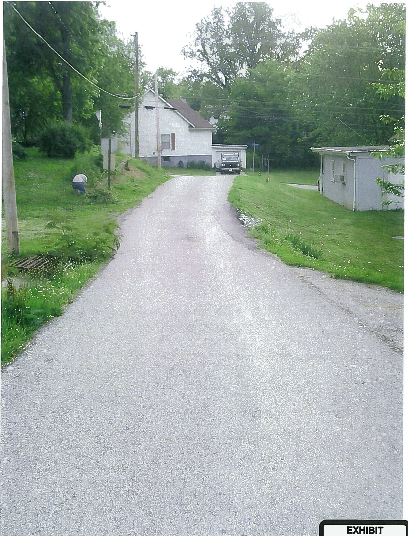
EXHIBIT tabbles 2