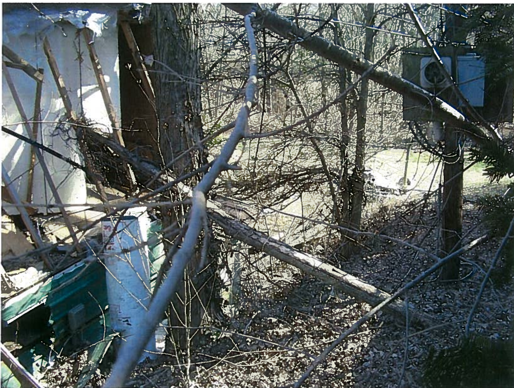
Date: 3/4/2009 Time: 1:16 P.M. Direction: southeast Exposure #: 002 Comments: demolition debris is on the ground to the south of the mobile home

File Names: 1810055092~03042009 - [Exp. #].jpg