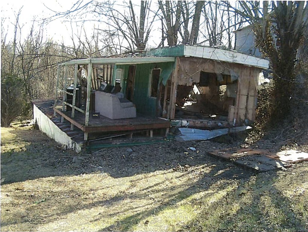
Date: 3/4/2009 Time: 1:18 P.M. Direction: southwest Exposure #: 005 Comments: street view