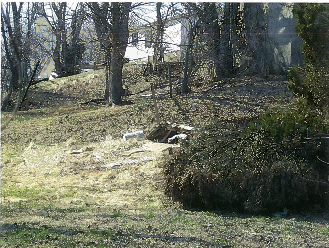
Date: 3/4/2009 Time: 1:21 P.M. Direction: northwest Exposure #: 006 Comments: demolition debris on the ground to the south of the mobile home

File Names: 1810055092~03042009 - [Exp. #].jpg