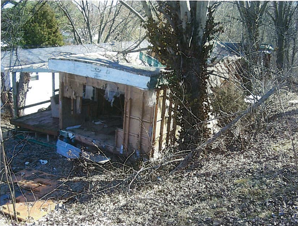
Date: 3/4/2009 Time: 1:15 P.M. Direction: southeast Exposure #: 001 Comments: interior of mobile home is exposed