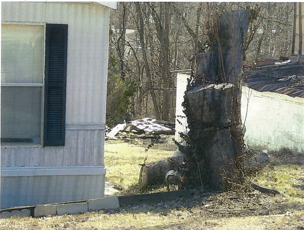
Date: 3/4/2009 Time: 1:17 P.M. Direction: southeast Exposure #: 004 Comments: demolition debris is on the ground to the south of the mobile home

File Names: 1810055092~03042009 - [Exp. #].jpg