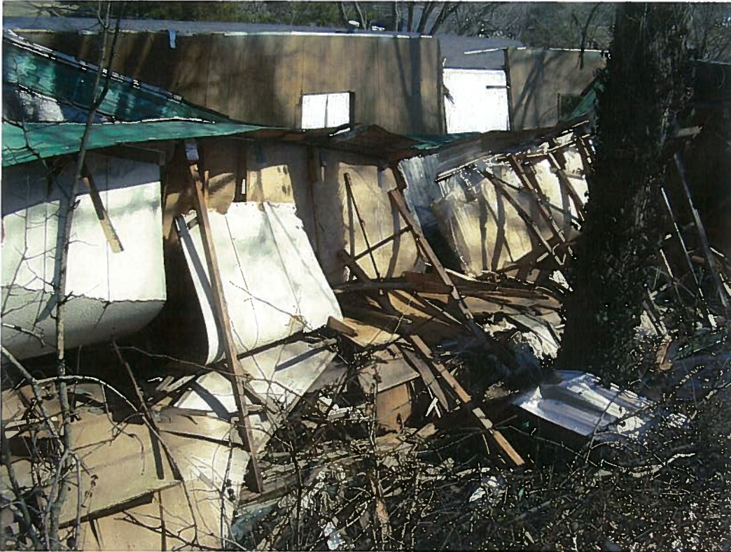
Date: 3/4/2009 Time: 1:16 P.M. Direction: southeast Exposure #: 003 Comments: mobile home has fallen in on itself